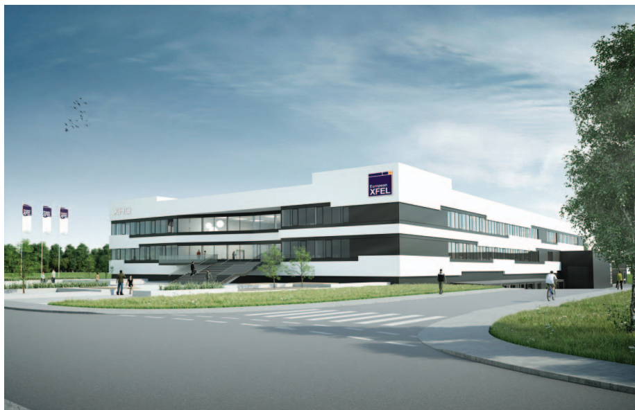
Illustration of the European XFEL headquarters (XHQ) building in Schenefeld, located on top of the underground experiment hall.

This workshop is part of the activities of the Helmholtz Virtual Institute “Nanoscale