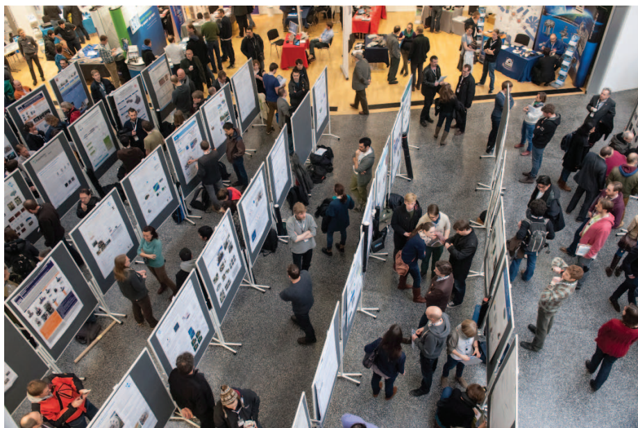
European XFEL and DESY Photon Science Users' Meeting 2015: one of the two venues of the poster sessions, including a vendor exhibition.