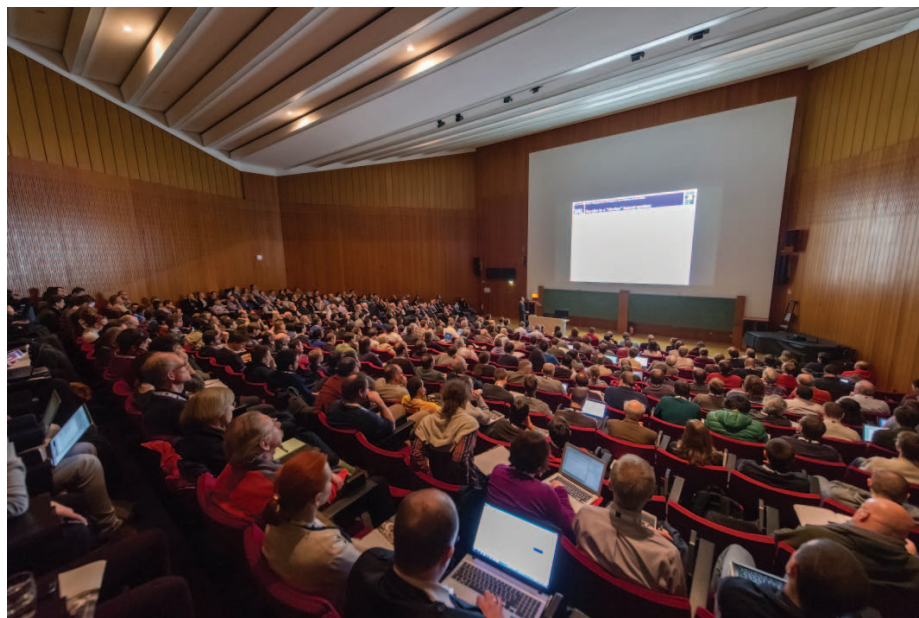
Participants of the annual European XFEL and DESY Photon Science Users' Meeting 2015.

All 91 undulator sections (each 5 m long) have been produced, shipped to Hamburg, and tested in dedicated magnetic laboratories for